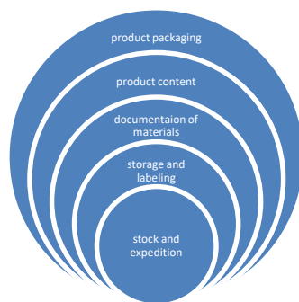
Fig. 1 Controlled areas by FLOCERT

FLOCERT also carries out regular audits 7 based on physical control and thorough accounting checks on all areas that are relevant to production and processing of Fairtrade products. The Company controls the following: