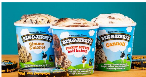
Fig. 2 Logo of trademark Ben&Jerry's Fairtrade certification